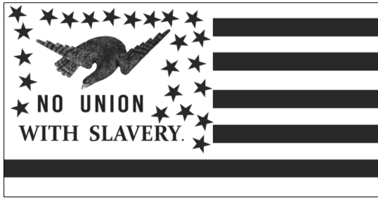
Unknown Digitally-Remastered Abolitionist Flag From 1860

Or Simply Utilize A White Flag, To Memorialize All Who Died All Throughout The World By Slavery; Those Who Surrendered. For The Seeking Of Surrendering To Truth, Nature As Authority For Unity, Clarity, Completion, Awakening, Simplicity